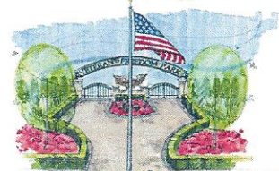
character sketch A

MAIN ENTRY TO PARK: From the main building, the main entry to the park will be a walkway that leads to the main building. The walkway will be paved and will have a large American flag on the right side. The walkway will be flanked by trees and shrubs. The main building will be a large, modern structure with a glass facade. The main building will be the central focus of the park. The main building will be a large, modern structure with a glass facade. The main building will be the central focus of the park.