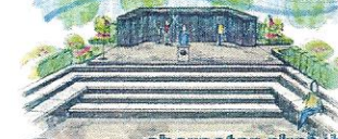
character sketch B

MAIN ENTRY TO PARK: From the main building, the main entry to the park will be a walkway that leads to the main building. The walkway will be paved and will have a large American flag on the right side. The walkway will be flanked by trees and shrubs. The main building will be a large, modern structure with a glass facade. The main building will be the central focus of the park. The main building will be a large, modern structure with a glass facade. The main building will be the central focus of the park.