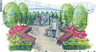
character sketch C

STAGE AREA: The stage area will be a large, open area with a paved surface. The stage area will be flanked by trees and shrubs. The stage area will be a large, open area with a paved surface. The stage area will be flanked by trees and shrubs.